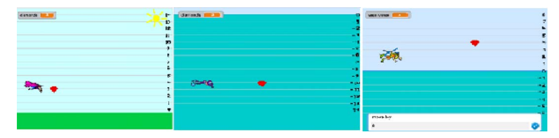
Figure 2: Screenshots of the three stages of Gem Game

In addition, the third group not only played the game but also engaged in code modification. In particular, students received instructions about how to make changes to the heroes of the story and the dialogue between them. Students had the chance to experiment with and decide for themselves on the final version of the storytelling part of the game (see Figure 3). After this, all teams completed the posttest and the questionnaire. Finally, semistructured interviews were conducted.