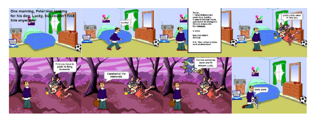
Figure 1: Screenshots of storytelling in the Gem Game

been kidnapped). By solving problems, the main character has to collect 30 diamonds to win the game. The game's format incorporates narrative elements aimed at motivating players (Bopp, 2007).