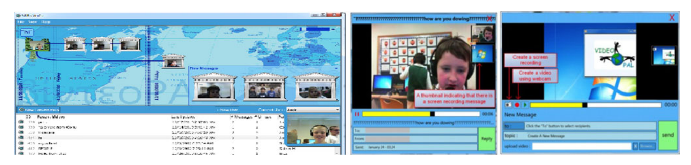
Fig. 2 VideoPal main window (left) and message view/creation windows (right)

In order to analyze the log data, Pearson's correlation coefficient between the children's VMC interactions was used, which is about quantifying the strength of the relationship between the interactions. For identifying the differences among email and VideoPal on children's perceptions, a \chi^2 test was performed. Data from interviews, observations and videos were combined for analyzing the content of children's communication. In addition, a video content analysis was carried out by two researchers, based on the four basic emotion categories of Oatley and Johnson-Laird's [25] in order to identify the emotions prevailing in the video exchanged.