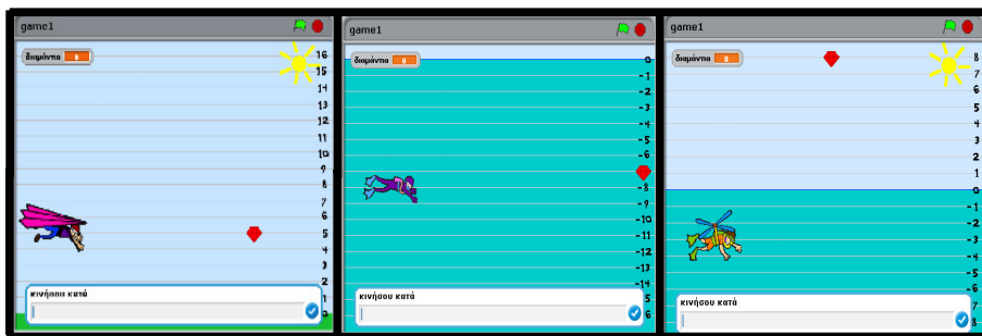
Fig. 3. Video game stages air (left), sea bed (center) and helicopter (right)

The first stage has only positive integers, the second stage has only negative integers, and the last stage has both positive and negative integers. Moreover, at each stage Peter wears a different uniform: a flyer uniform in the first stage; a diver uniform in second stage; and a helicopter uniform in the third stage.