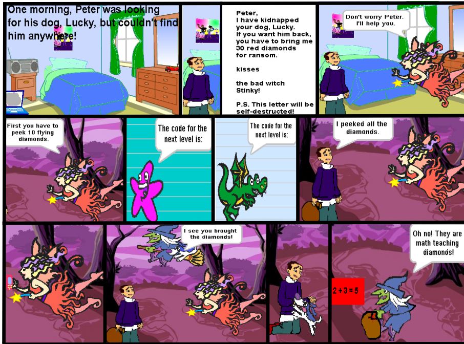
Fig. 2. Gem-Game Storytelling Structure

The ultimate goal of the player is to retrieve his dog by collecting diamonds. To achieve the ultimate goal, Peter must win the 3 stages (fig. 3). In particular, Peter must correctly add/subtract in order to earn diamonds. For example, if Peter is positioned on line 6, and the diamond is on line 1, the player must write -5 in order to gain the diamond. The player completes each stage by collecting 10 diamonds.